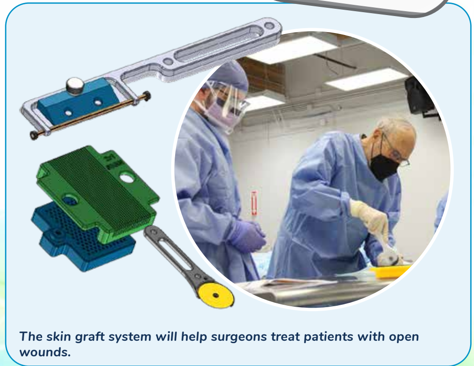
The skin graft system will help surgeons treat patients with open wounds.