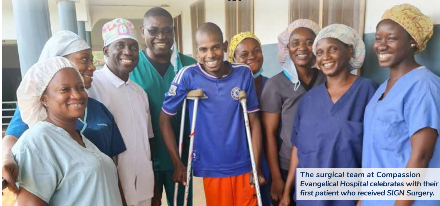
The surgical team at Compassion Evangelical Hospital celebrates with their first patient who received SIGN Surgery.