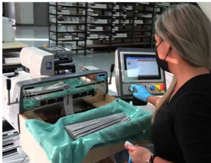
Above: Autobagger in the Shipping Department. Below: Star machine for making screws. Below-left: Bioskills lab in Procedural Learning Center.

We completed the Procedural Learning Center, where we can host hands-on training for surgeons. All these improvements work together, enabling SIGN Staff to meet the growing need for fracture care in low-income countries.