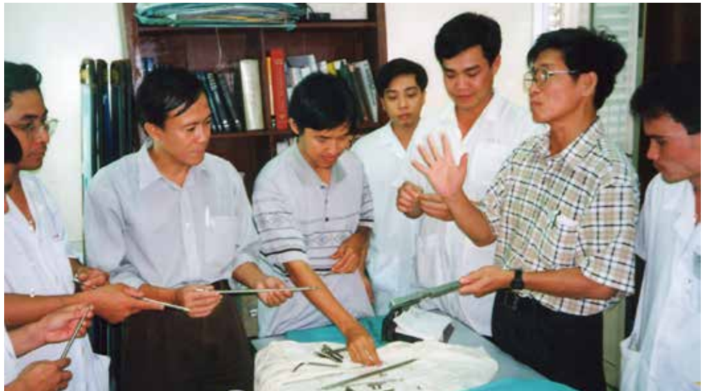
Vietnamese surgeons reviewed and tested the first SIGN Sets, and provided invaluable feedback.

We hope you enjoy this journey back through SIGN's history as we move through 2024. There will be a highlight in each newsletter, bonus email messages, and social media posts. If there something you are interested in learning more about, email us at info@signfracturecare.org