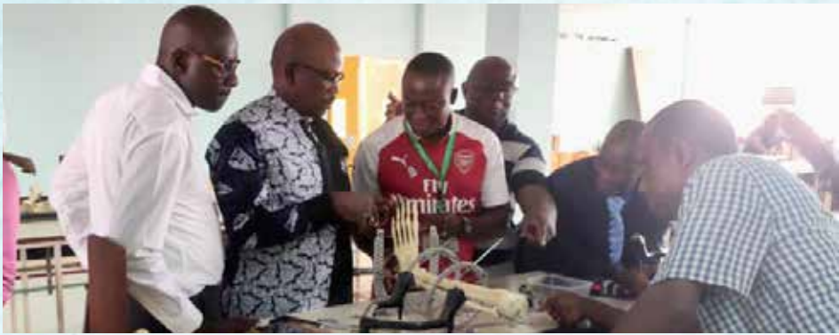
SIGN Surgeons in Nigeria learned to correct limb deformities with ring fixators.