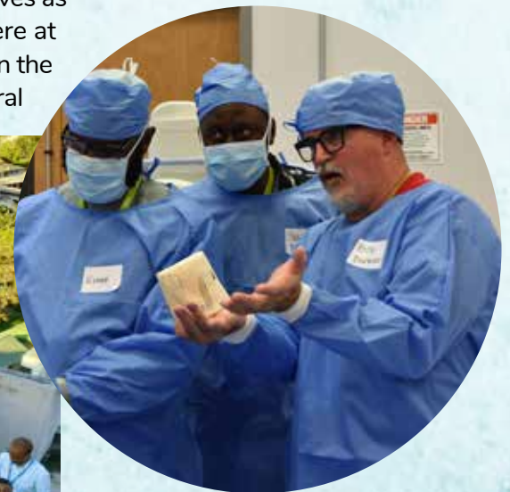
Conferences in Tanzania (left) and Richland (above) provided hands-on learning and opportunities for SIGN Surgeons to teach their colleagues.