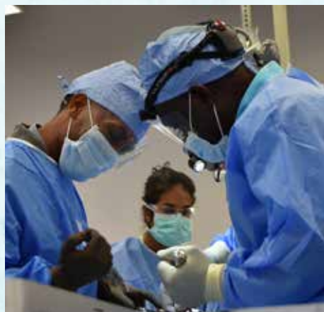
Surgeons practiced spine surgery at the 2023 SIGN Conference.

We are grateful to everyone who has supported us these 25 years. We are eager to take a leap into the future with you, to continue spreading our vision of creating equality of fracture care.