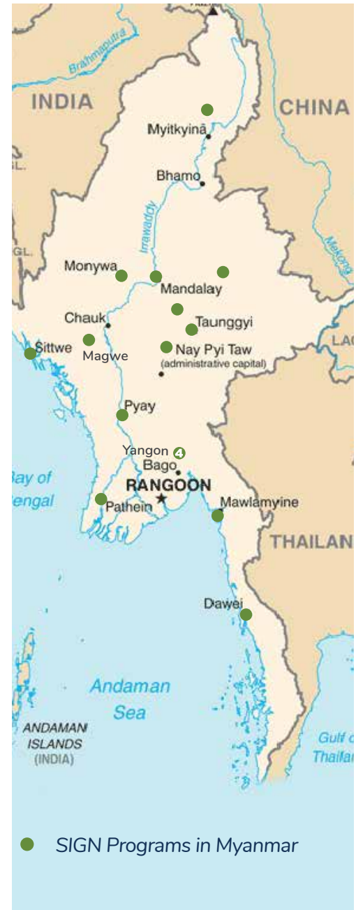
● SIGN Programs in Myanmar