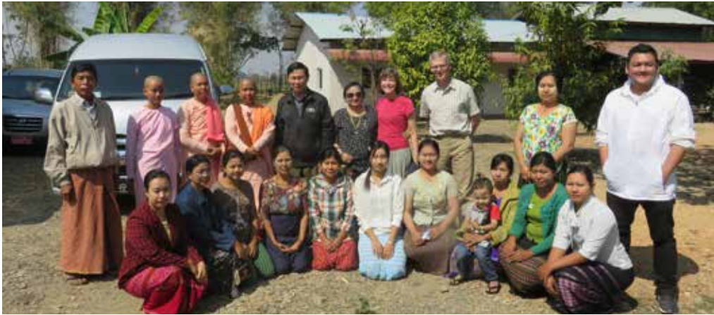
A new SIGN Program in Pyay will help patients who previously were cared for through the Mobile SIGN Program.