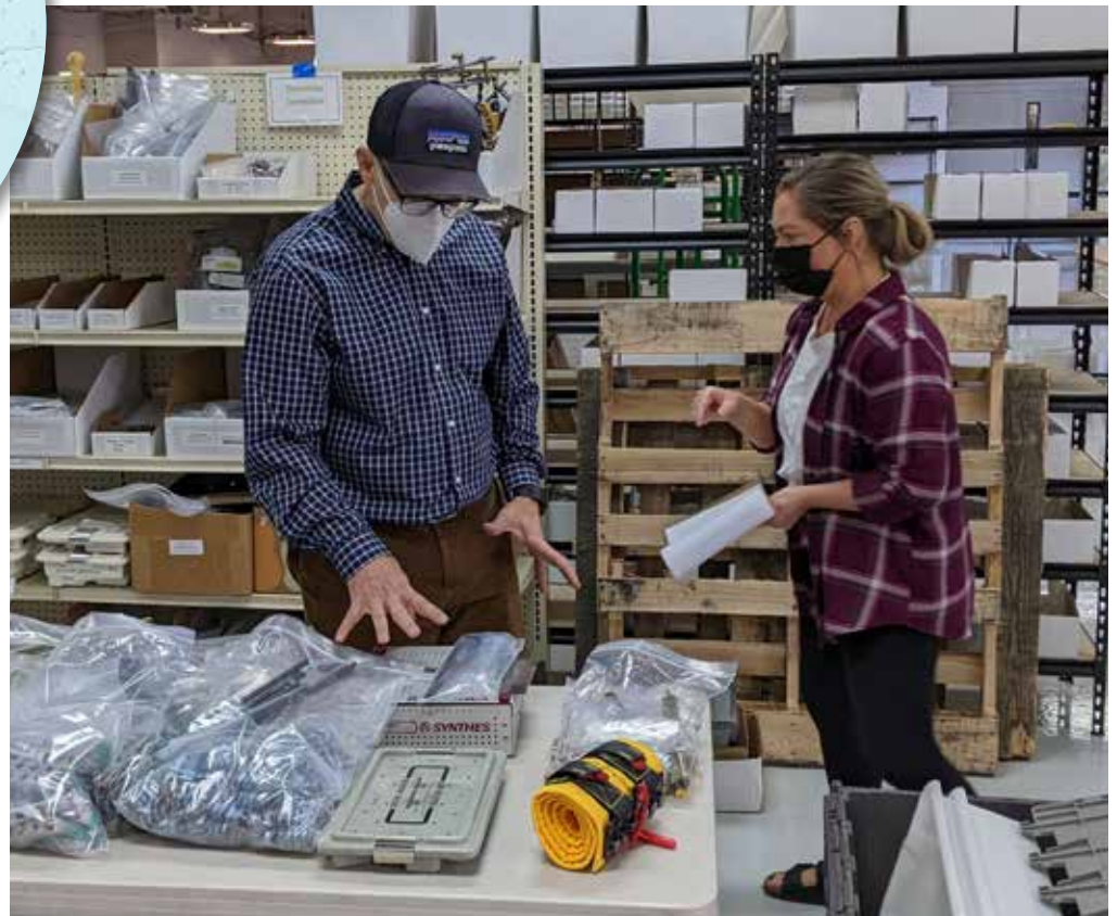
SIGN Board Member and Staff prepare shipments of SIGN Instruments, Nails, and donated external fixation devices.

"I am so thankful to you for such a generous donation. It will help us in our effort with wounded soldiers, as well as with injured civilians." — Ukraine Surgeon