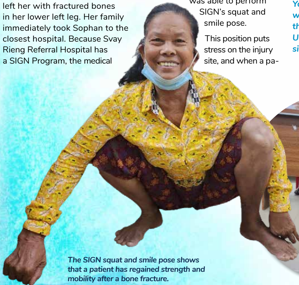
The SIGN squat and smile pose shows that a patient has regained strength and mobility after a bone fracture.

You can help the next person with a bone fracture get the care they need by donating today. Use the enclosed form or go to signfracturecare.org/donate