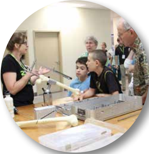
SIGN hosted a public Open House and an event for Kiwanis members attending the PNW District Convention.